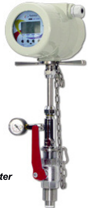
Model EL 1222 Electromagnetic Flow Meter